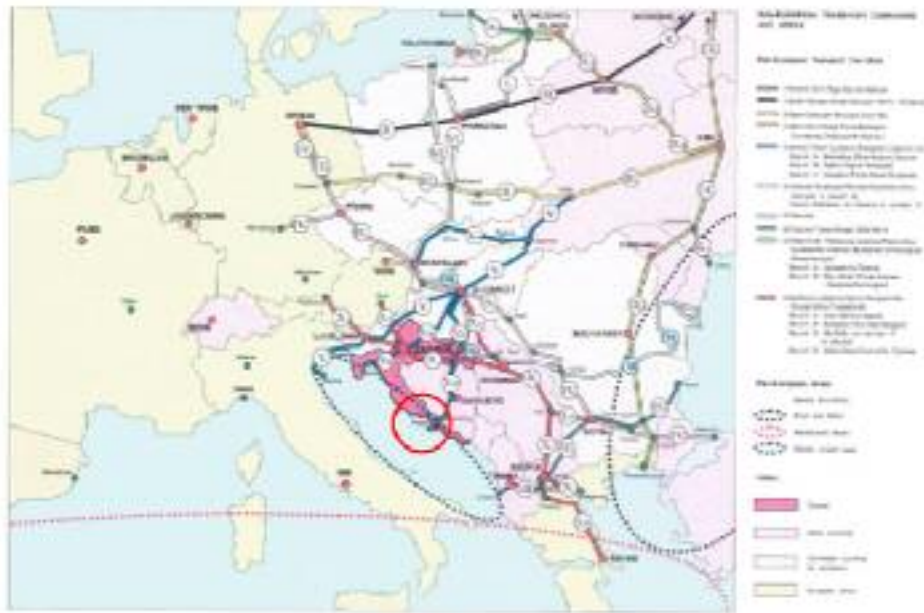
Figure 1-1: GEO - TRAFFIC LOCATION OF THE PORT OF PLOČE